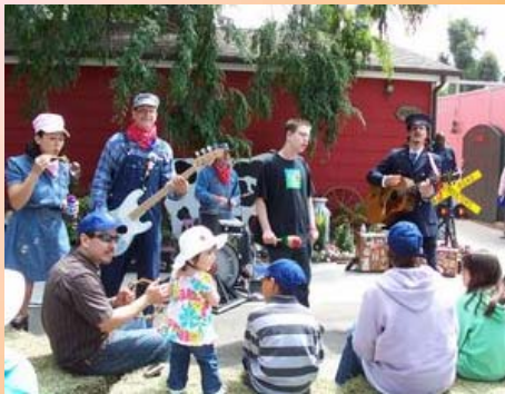
The musical group THE CONDUCTORS entertains the crowd at Danny's Farm on April 4 th .